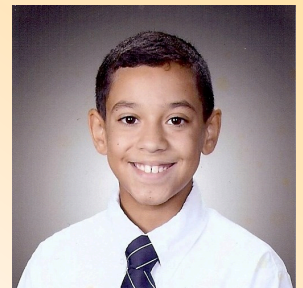
Bishop-Trinity Valley School A/B Honor Roll Student, Perfect Attendance

“When I hear the words STAR student, I think of a well-rounded, “high GPA” student. By high GPA student, I mean a student who works as hard as they can, to do the best that they can. Knowing that someone besides my parents receives my report card motivates me to do better, because if more people know what I am capable of and believe in me, the better. The studying and hard work is totally worth it because I see the rewarding results. I knew someone was watching me so I did my best. If I could say one thing to my sponsor, I would say thank you so much for giving me the opportunity to see my new abilities and thank you for giving me the opportunity to go to TVS.”